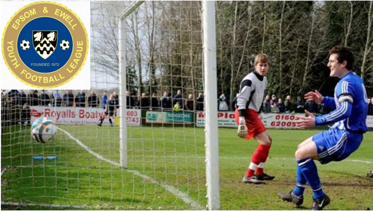
FIFA Laws of the Game 2013-14